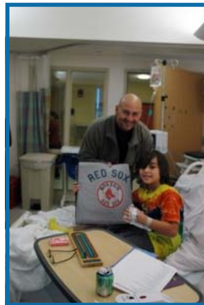
Terry Francona during his visit to the Children's Hospital Boston

proves our cause is worthwhile, and it motivates us to begin our projects for the next year. I really hope the kids find comfort in them when needed, but can also enjoy them and have a lot of fun with them. That is the purpose of our cause".