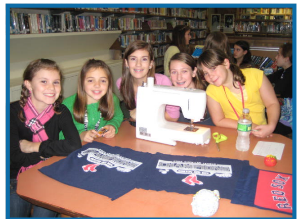
The girls of Chapman Quilt Club working on quilts to be donated to Children's Hospital Boston